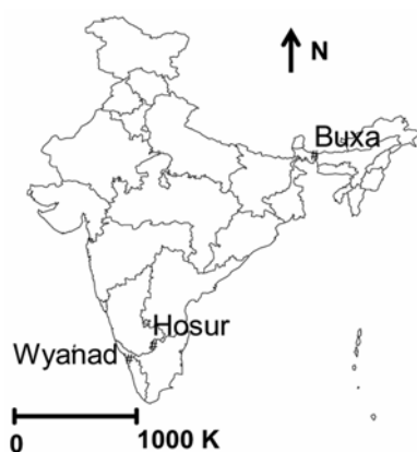
Figure 1. Location of the three experimental sites. High rainfall regime – Tiamari, Buxa Tiger Reserve, West Bengal; Medium rainfall regime – Amavayal, Wyanad Wildlife Sanctuary, Kerala and Low rainfall regime – Gullati, Hosur Forest Division, Tamil Nadu.

TR, Tiger Reserve; WLS, Wildlife Sanctuary and FD, Forest Division.